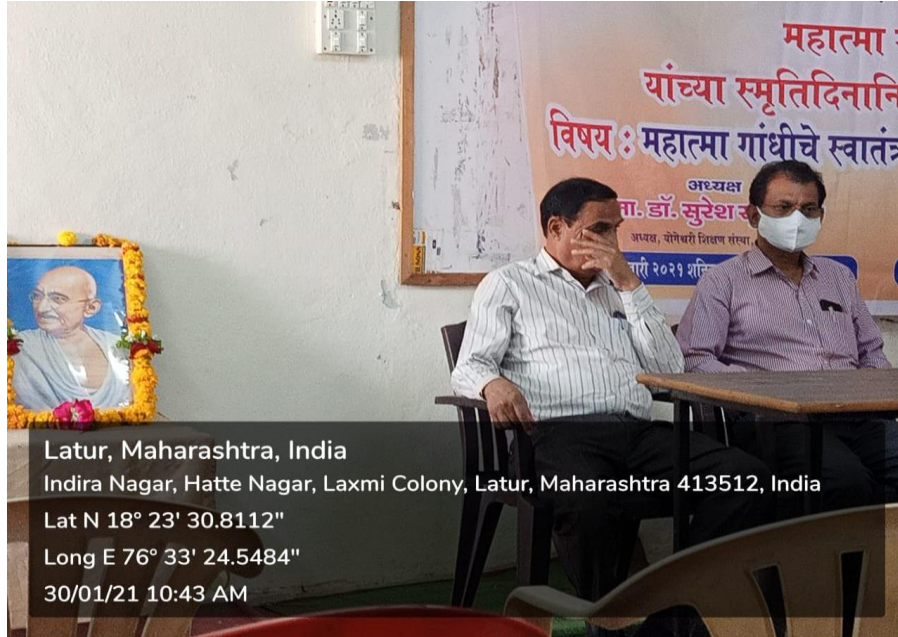
Mahatma Gandhi Death Anniversary (30 th January 2021)