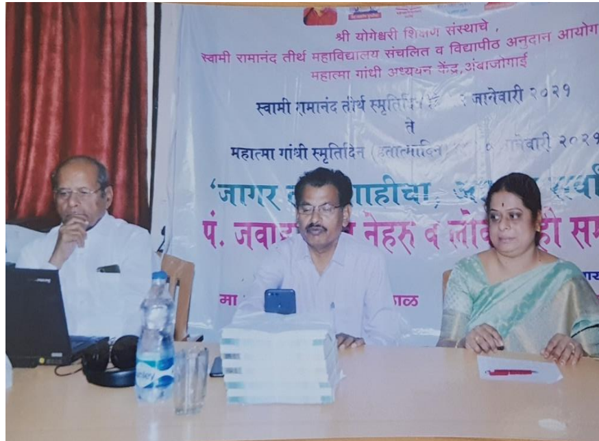
Online Webinar on Pandit Jawaharlal Nehru & Democratic Socialism (29 th Jan 2021)