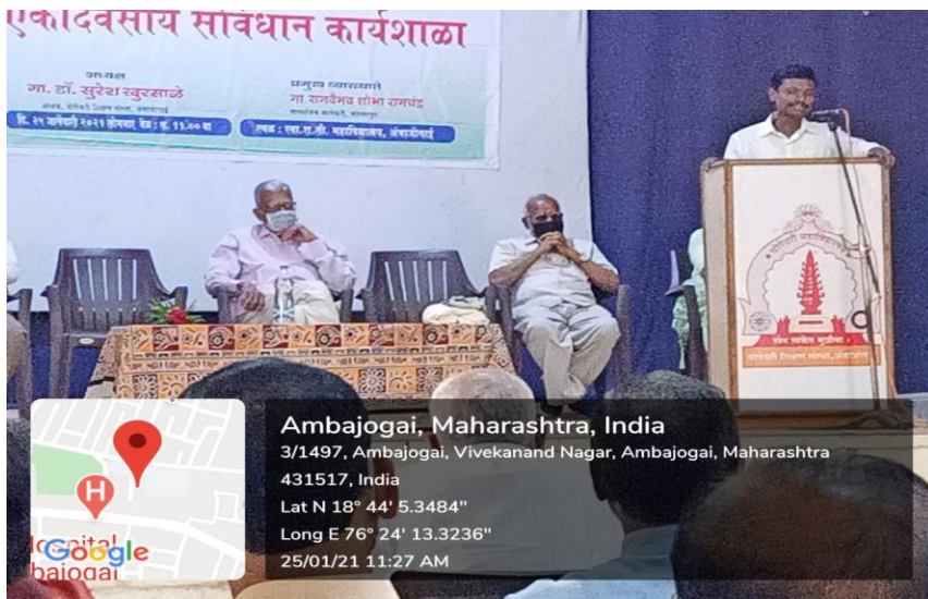
ONE DAY WORKSHOP ON INDIAN CONSTITUTION (25 th JANUARY 2021)

Ambajogai, Maharashtra, India 3/1497, Ambajogai, Vivekanand Nagar, Ambajogai, Maharashtra 431517, India Lat N 18° 44' 5.622" Long E 76° 24' 13.1724" 25/01/21 12:00 PM