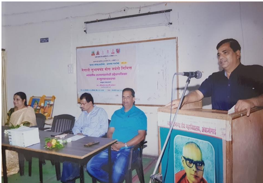
Webinar on Preamble of Indian Constitution and its value system (23 rd Jan 2021)