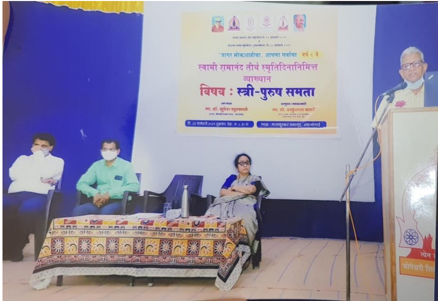
Lecture on Gender Equality (22th Jan 2021)