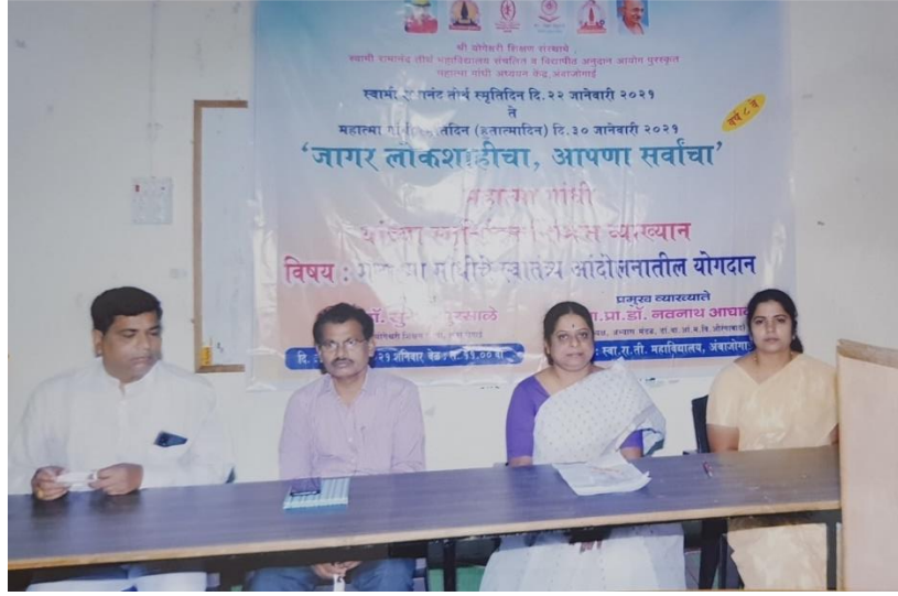
Mahatma Gandhi Death Anniversary (30 th Jan 2021)