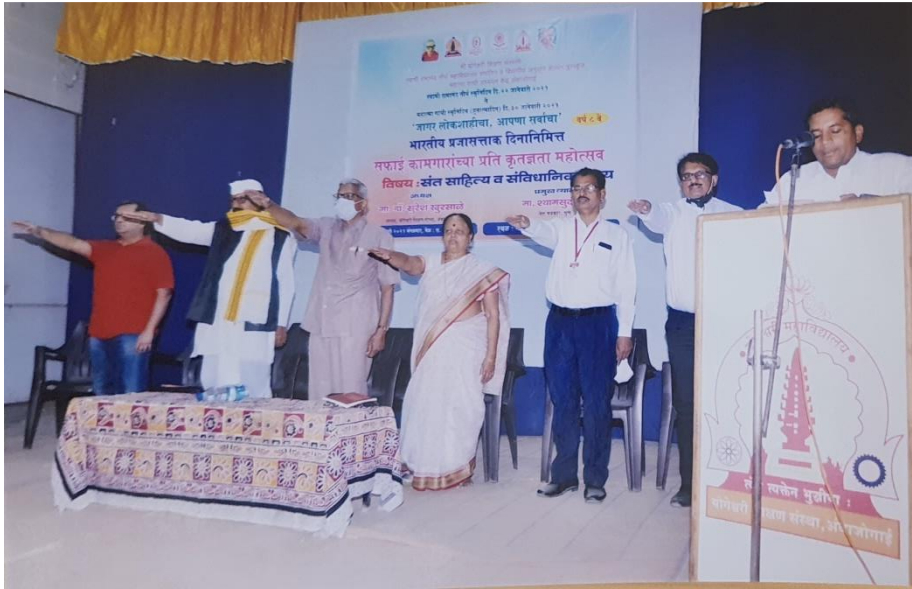
Republic Day (26 th Jan 2021)