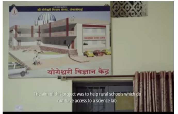
Sr. Scientist and Chairman of Marathi Vidnayan Parishad Solapur (Maharashtra) visited the Proposed Site of Science Center. Secretary of YES, Principal of the College and other office bearers of the YES are there in visit.