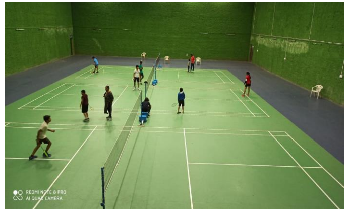
Internal View of the Indoor Stadium