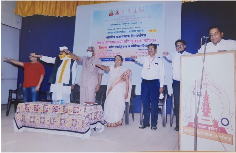
Republic Day (26 th Jan 2021)