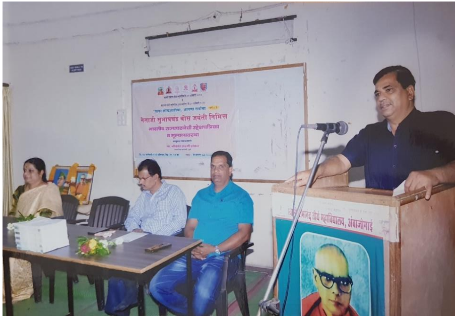
Webinar on Preamble of Indian Constitution and its value system (23 rd Jan 2021)