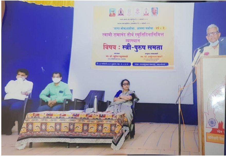
Lecture on Gender Equality (22th Jan 2021)