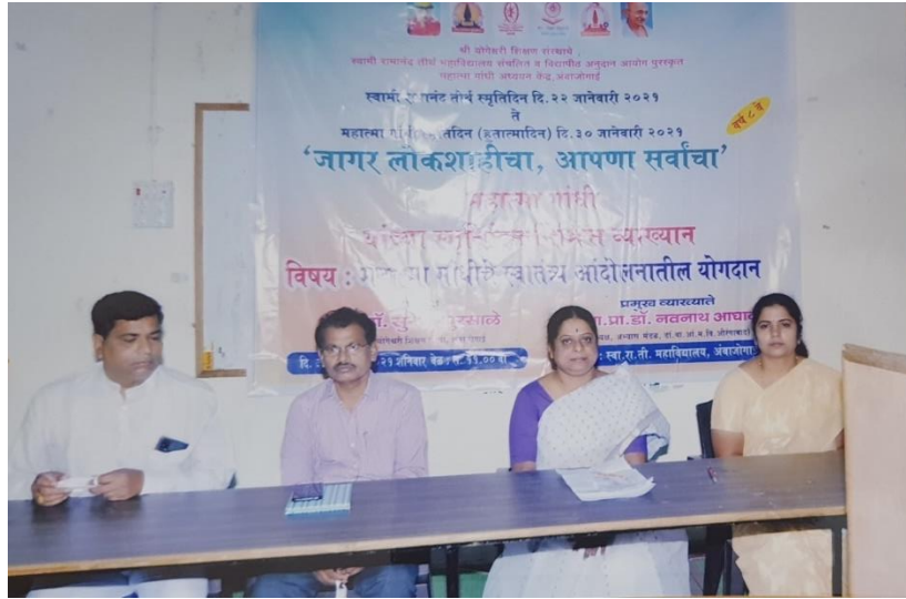
Mahatma Gandhi Death Anniversary (30 th Jan 2021)