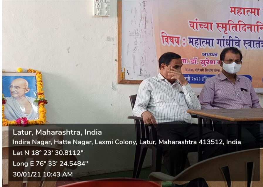
Mahatma Gandhi Death Anniversary (30 th January 2021)