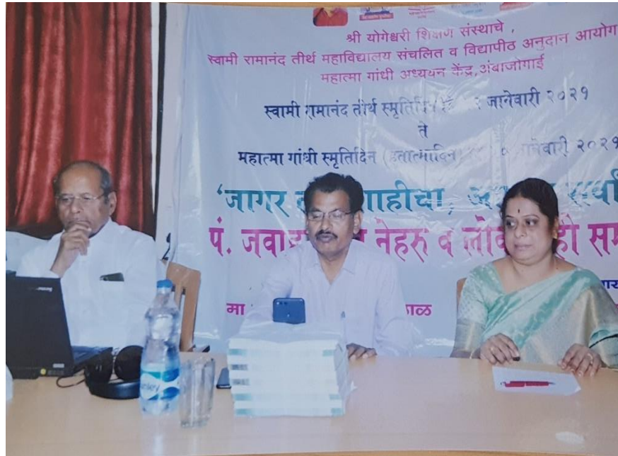
Online Webinar on Pandit Jawaharlal Nehru & Democratic Socialism (29 th Jan 2021)