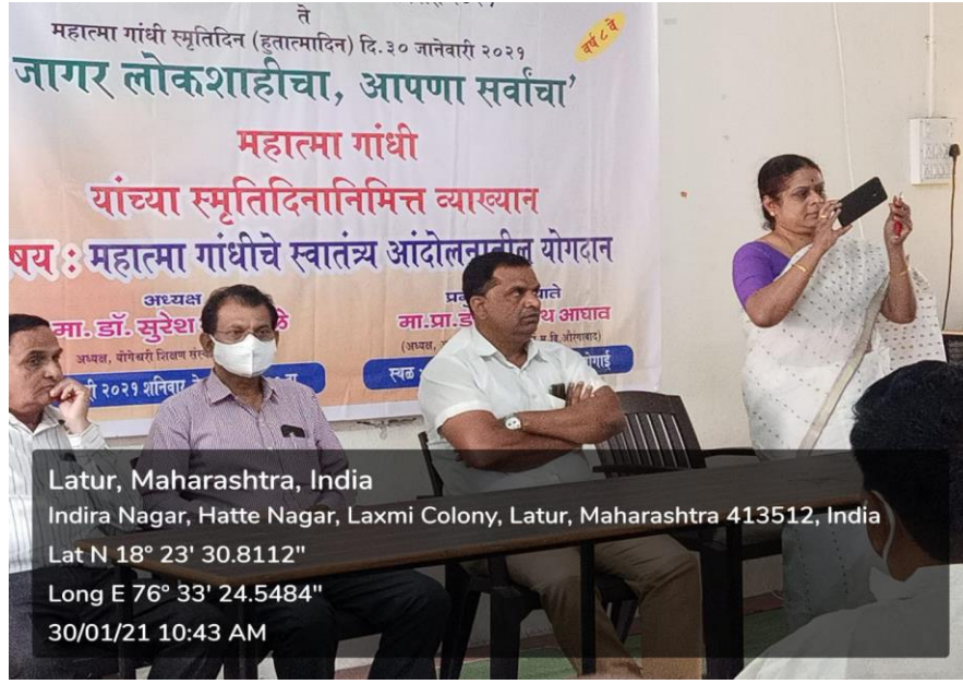
Mahatma Gandhi Death Anniversary (30 th January 2021)