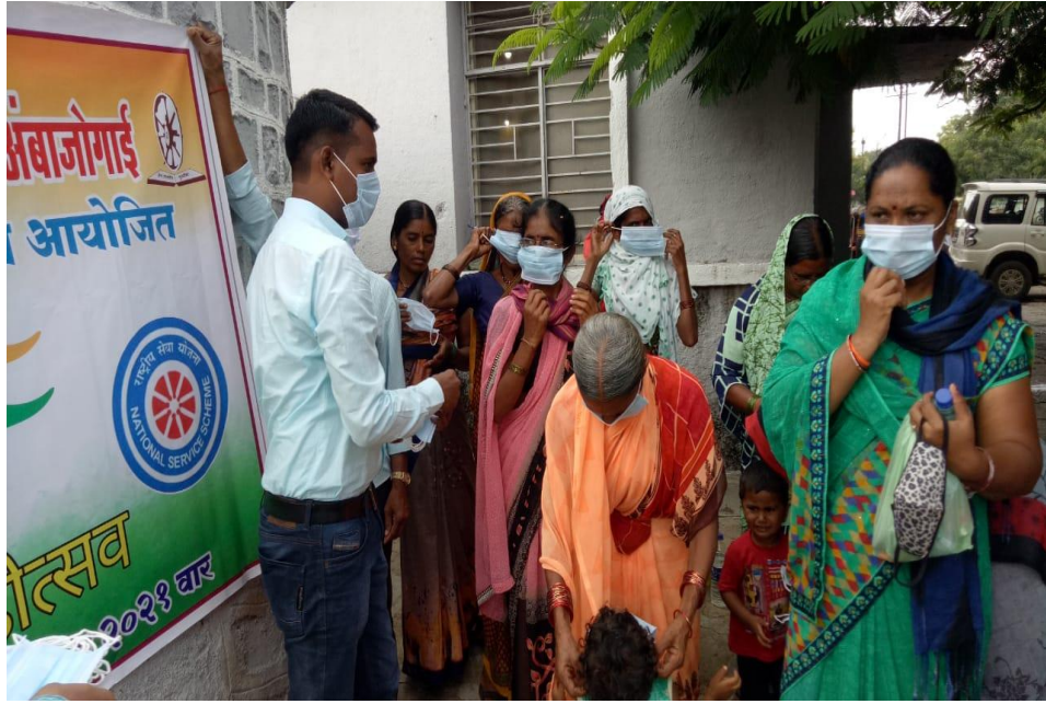
Mask distribution to citizens