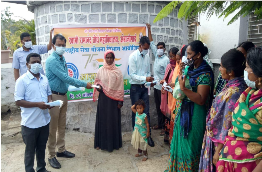
Mask distribution to citizens