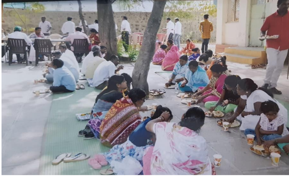
Lunch for sweepers (26 th Jan 2021)