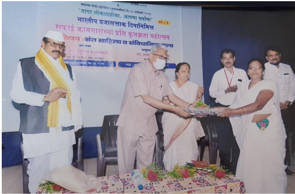
Gifts for sweepers (26 th Jan 2021)