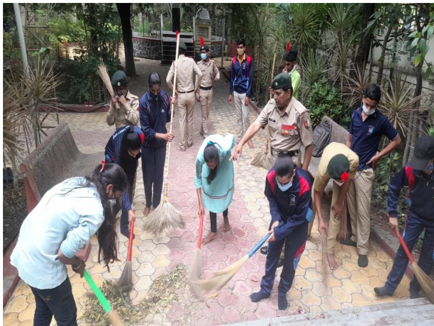
Campus cleaning by students