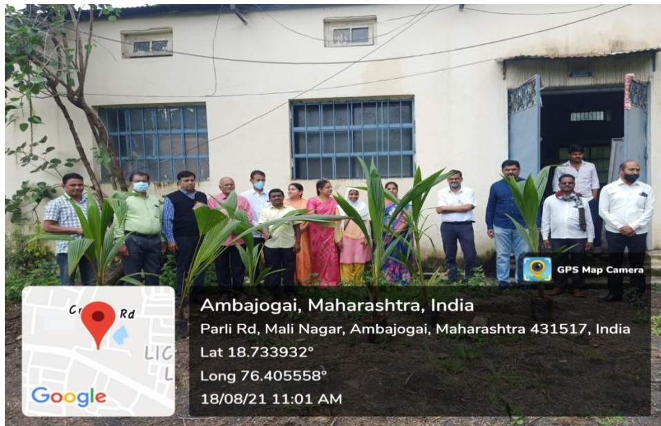
Tree plantation by alumni staff in campus (18 th Aug 2021)