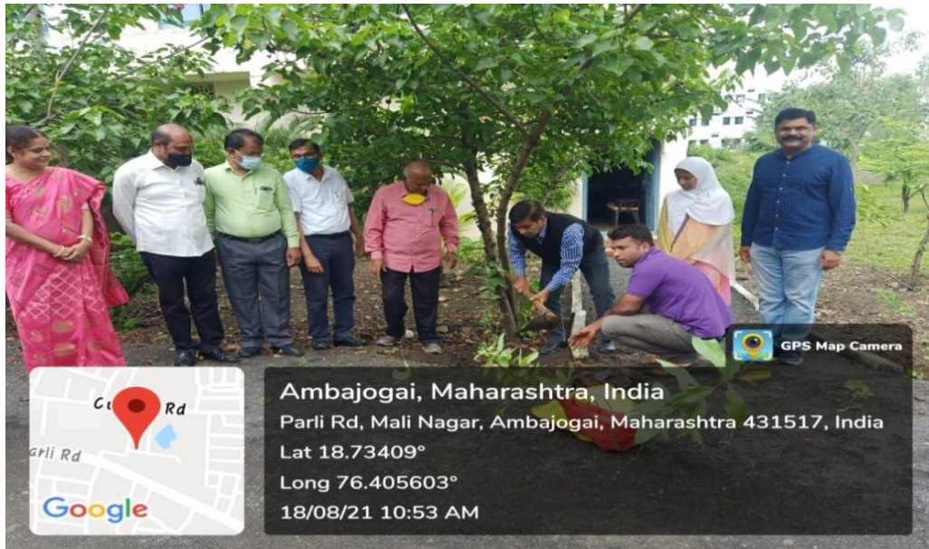
Tree plantation by non-teaching staff in campus (18 th Aug