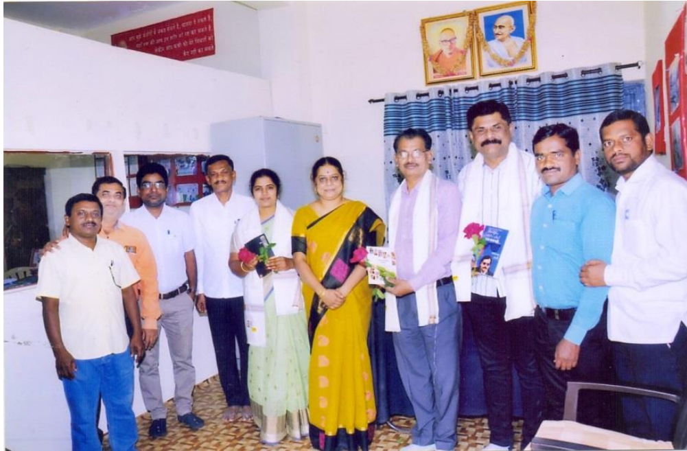
Book Distribution and felicitation of Staff