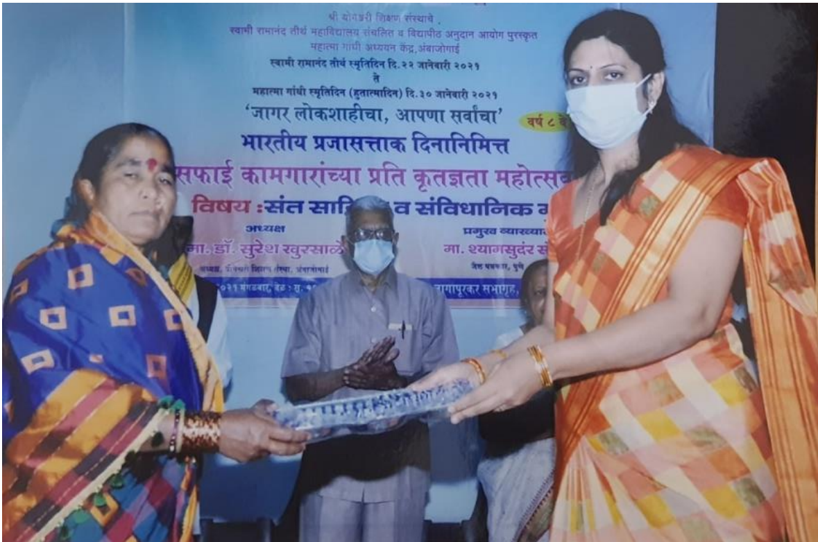
Distribution of plates to sweepers (26 th Jan 2021)