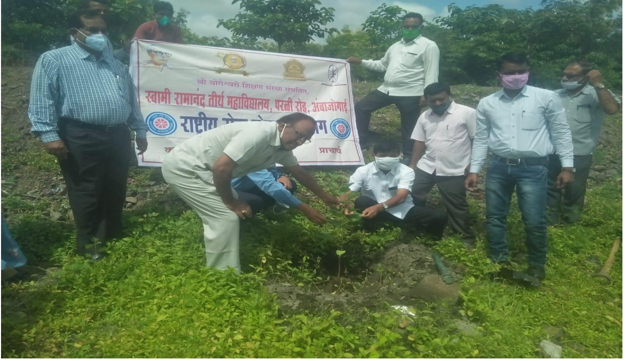
Tree Plantation by N.S.S. Volunteers