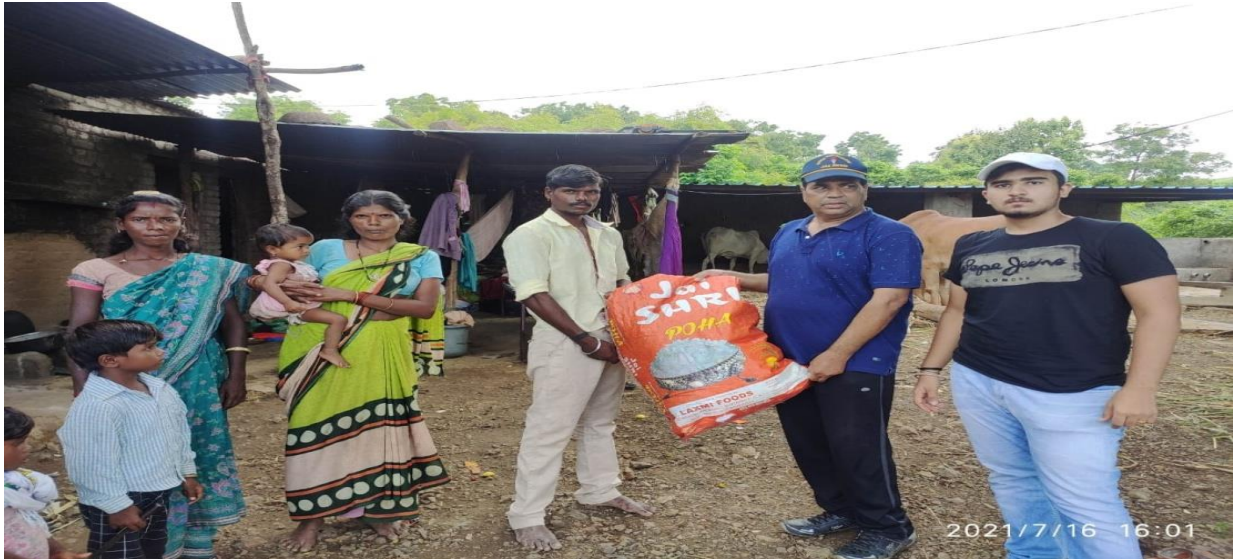
N.C.C. Cadets & Officers distributing Grocery and food to Sugarcane workers

N.C.C. officers and Cadets visited the sugarcane workers and interacted with them. This interaction made the cadets to understand the issues of the sugarcane workers. After the interaction the N.C.C. officers and cadets distributed the Grocery and food items among the workers.