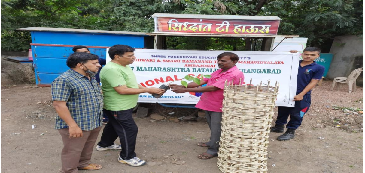
Sapling Distribution by N.C.C. Officers and Cadets

The target of 5000 saplings distribution was achieved by the N.S.S. volunteers and N.C.C. cadets. The drive was organized on the World Environment Day. Awareness programmes on conserving nature and a series of saplings distribution drives were organized occasionally on the birth anniversaries of the national leaders and freedom fighters and the birthdays of the staff members and N.S.S. volunteers and N.C.C. cadets. The drive was organized in Ambajogai and nearby villages.