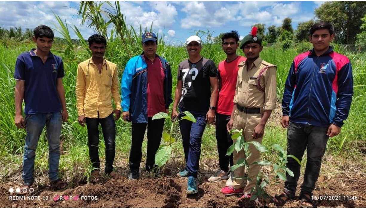
Tree Plantation by N.C.C. Officers and Cadets