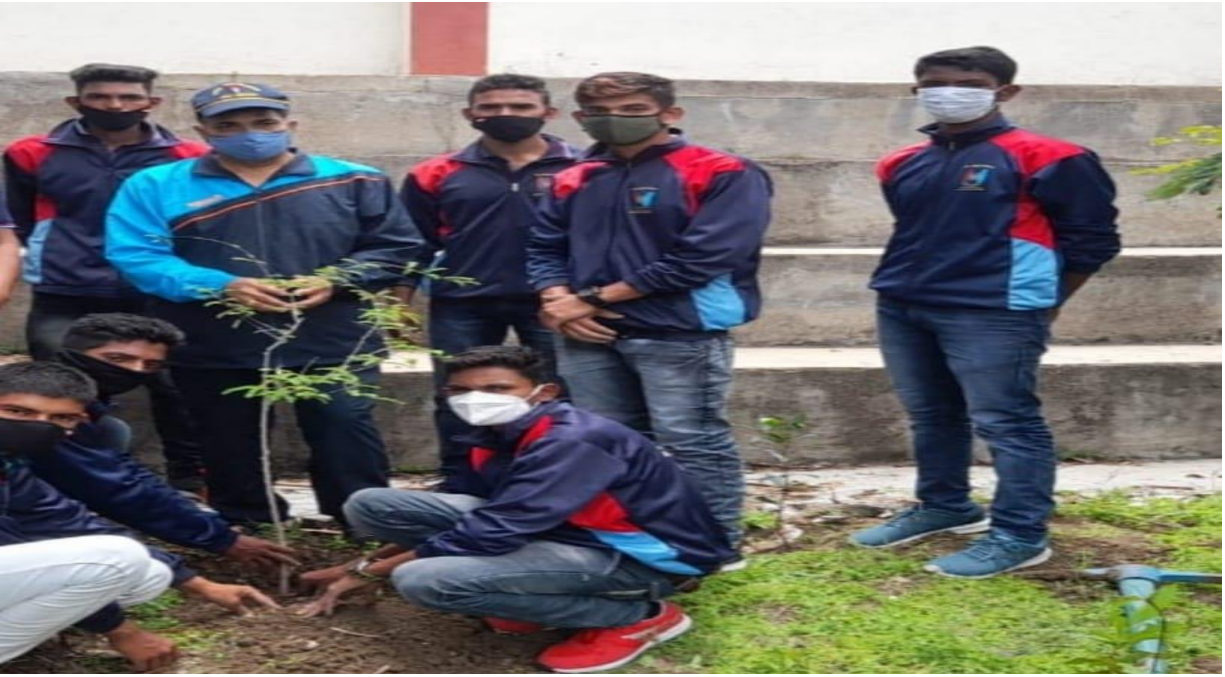
Tree Plantation by N.C.C. Officers and Cadets