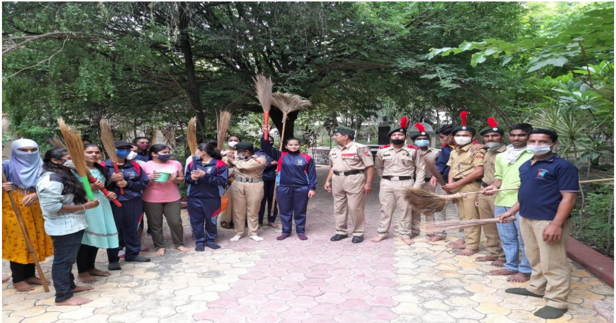
N.C.C. Cadets & N.S.S. Volunteers participated in Cleaning Campaign

N.S.S. Volunteers and N.C.C. cadets of the college organized the cleaning campaigns in the college premises, nearby localities and religious places Of Ambajogai.