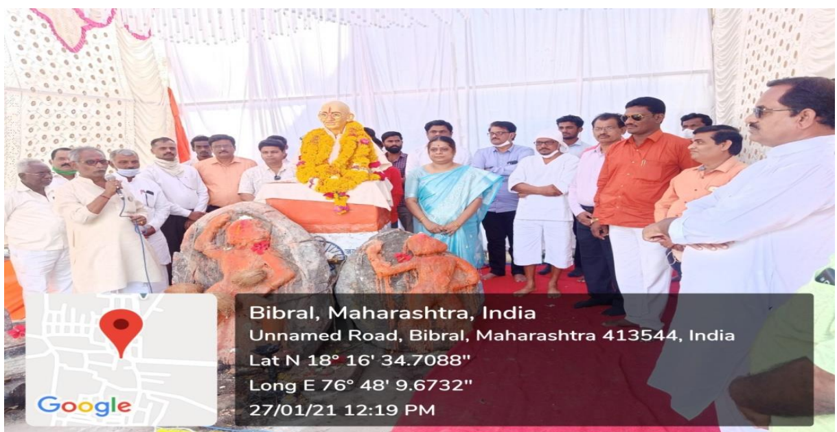
The College Staff, Students and Management offering homage to Gandhiji Statue