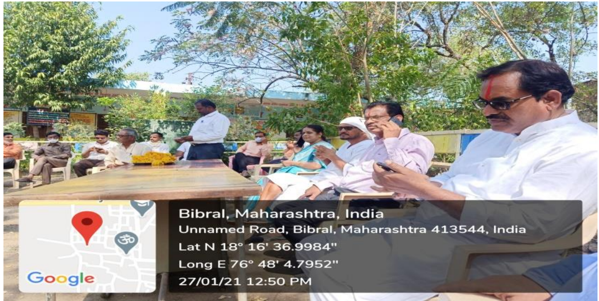
The College Staff, Students and Management Visited Gandhi baba Yatra Ujed (Tq. Shirur Anantpal, Dist. Latur)