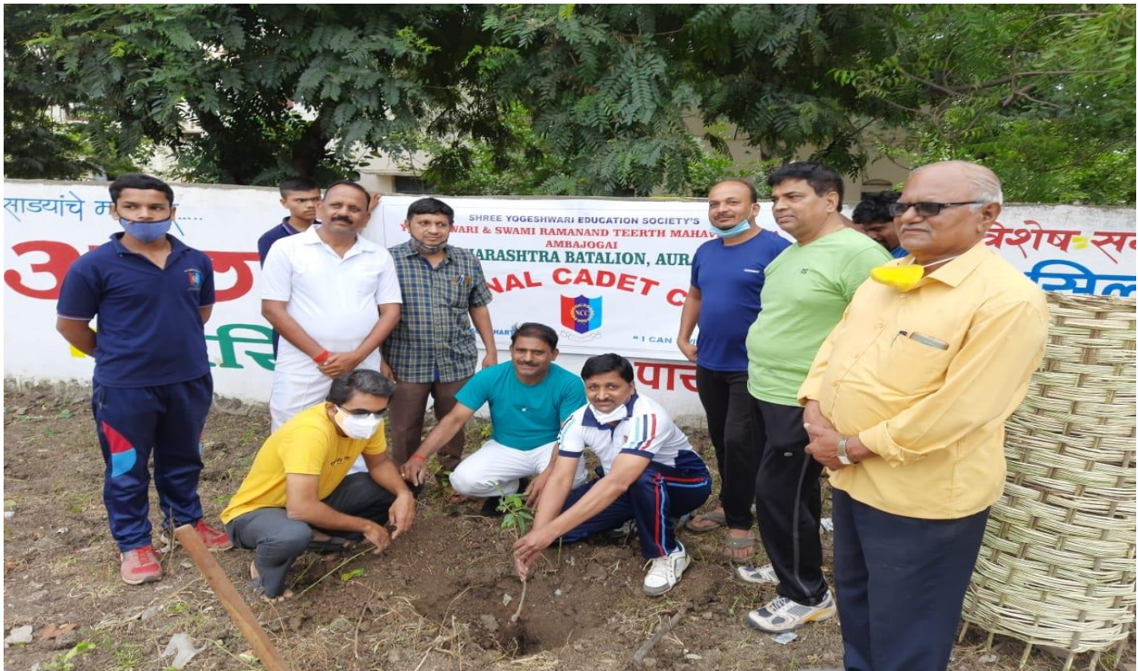
Tree Plantation by N.C.C. Officers and Cadets