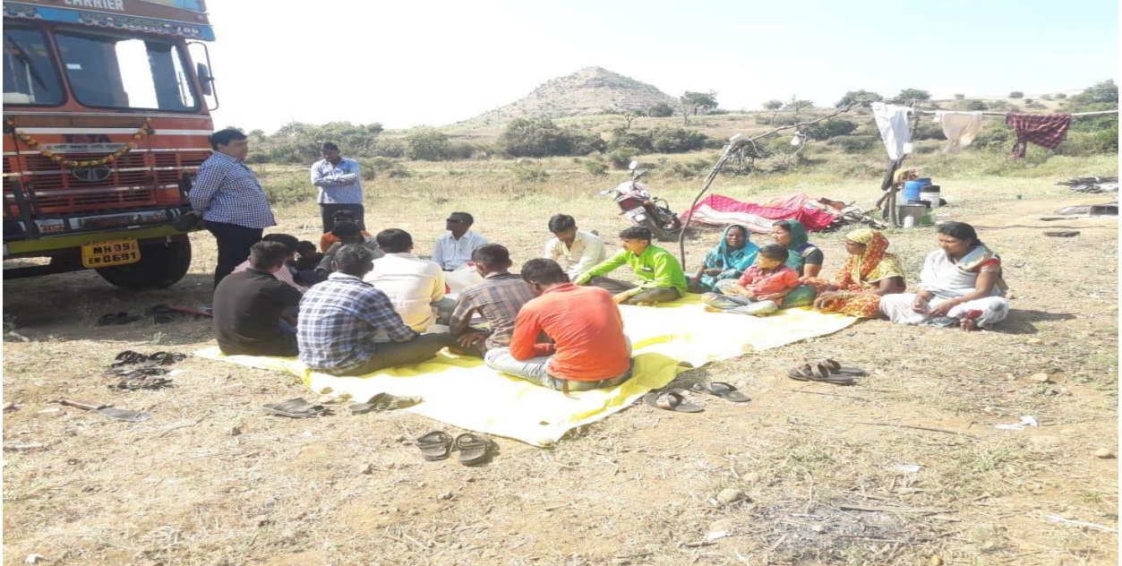
N.C.C. Cadets & Officers having an interaction with the Sugarcane workers