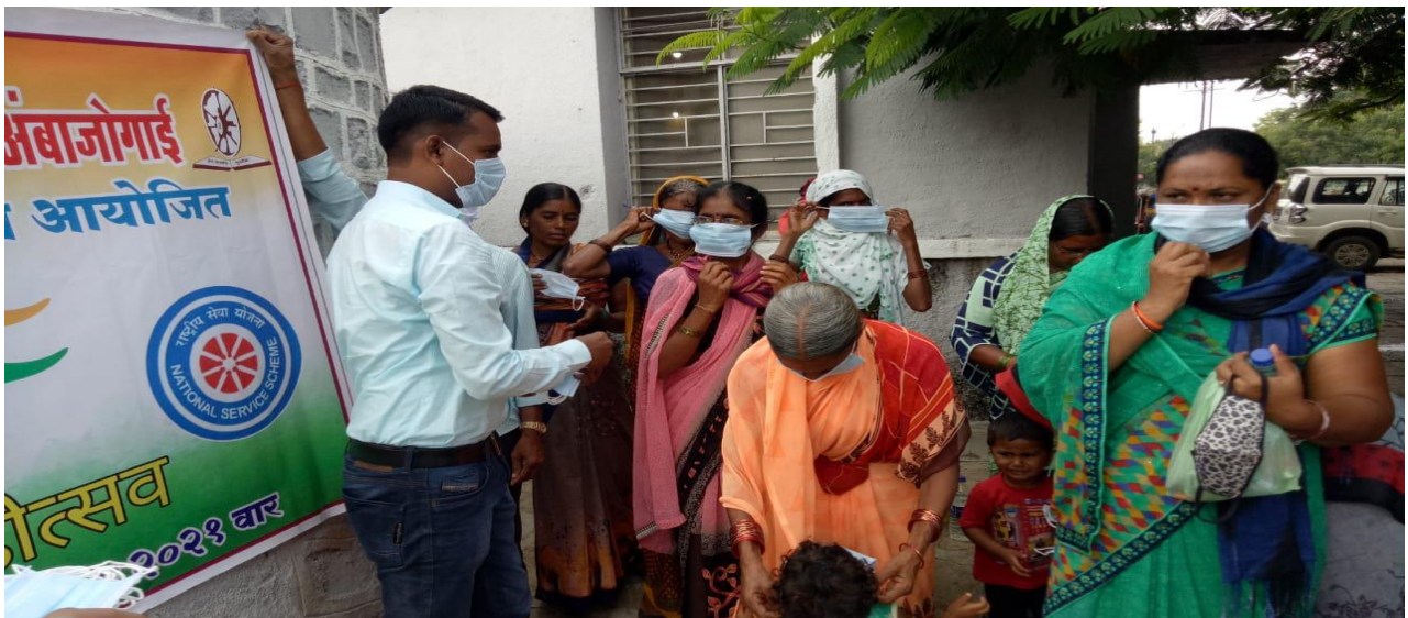
N.S.S. Volunteers and N.C.C. Cadets distributed the masks among the college students, local citizens, and patients in Government Hospital during the covid19