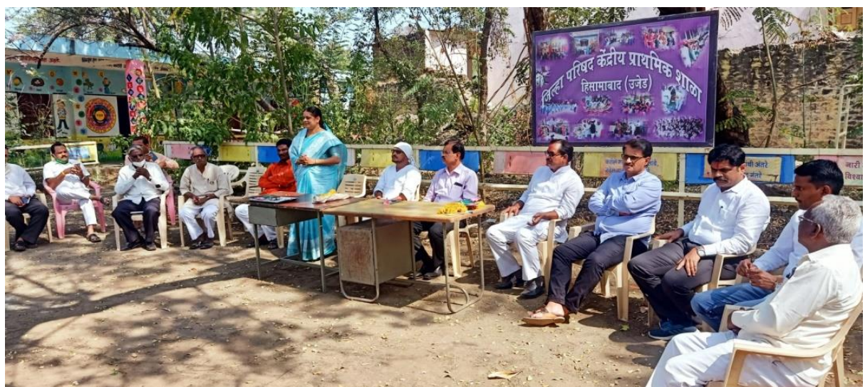
The College Staff, Students and Management Visited Gandhi baba Yatra Ujed (Tq. Shirur Anantpal, Dist. Latur)