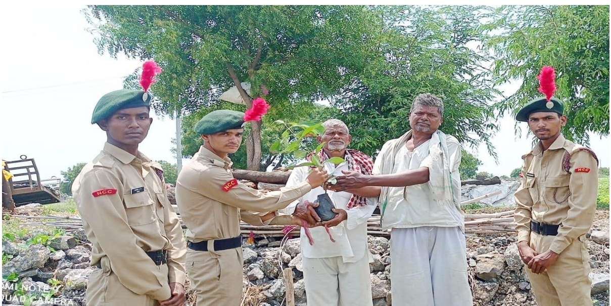
Sapling Distribution by N.C.C. Officers and Cadets