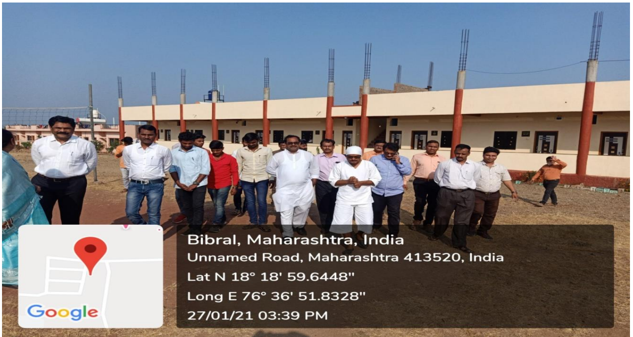
The College Staff, Students and Management Visited 'Sevalaya' Dist. Latur