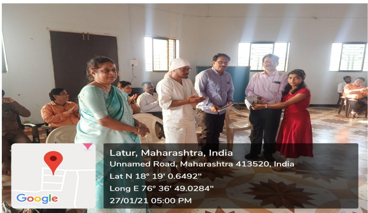
The College Staff, Students and Management Visited 'Sevalaya' Dist. Latur