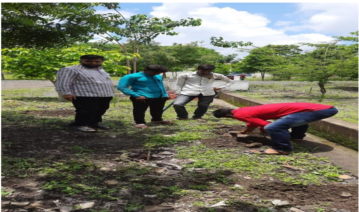
Tree Plantation by N.S.S. Volunteers