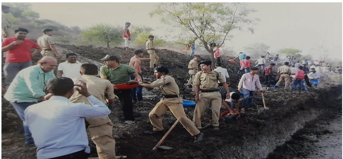
N.C.C. Cadets & Officers Developed Band