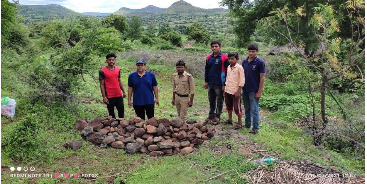
N.C.C. Cadets & Officers Developed Band

The N.C.C. Cadets developed a Band to save water for the people and agriculture. The Officers and Cadets interacted with the villagers about the importance of saving water in the conditions of draught. The N.C.C. Officers and the College Management also participated in this campaign.