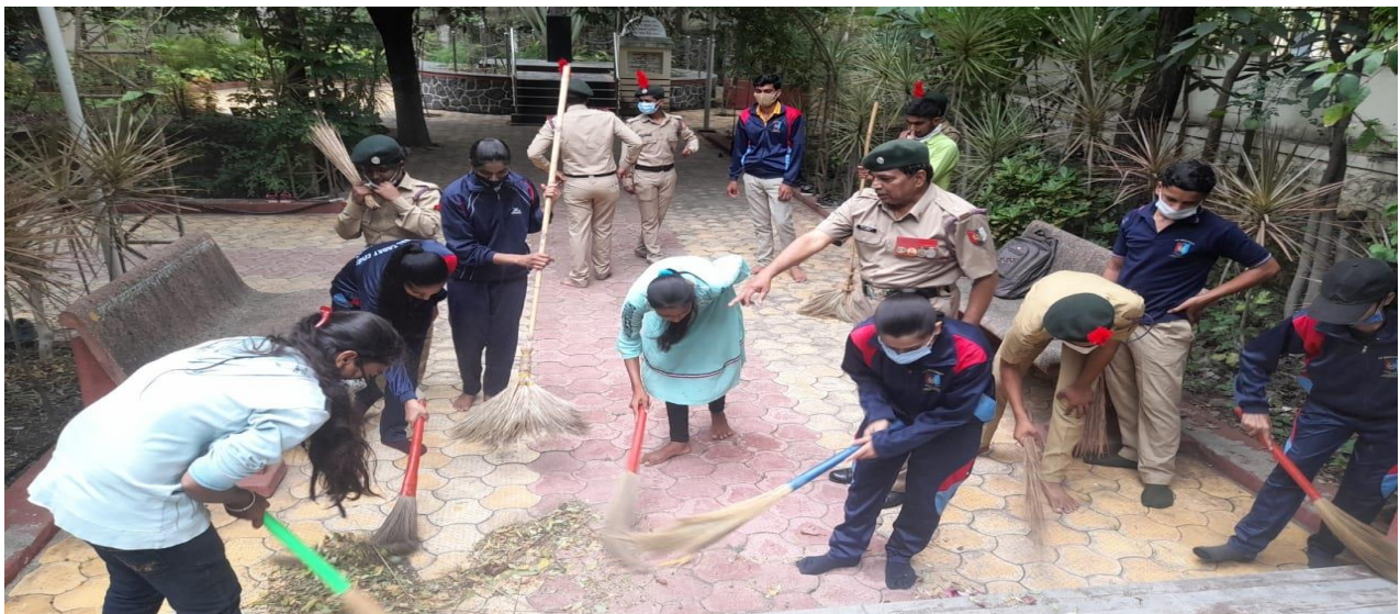
N.C.C. Cadets & N.S.S. Volunteers participated in Cleaning Campaign