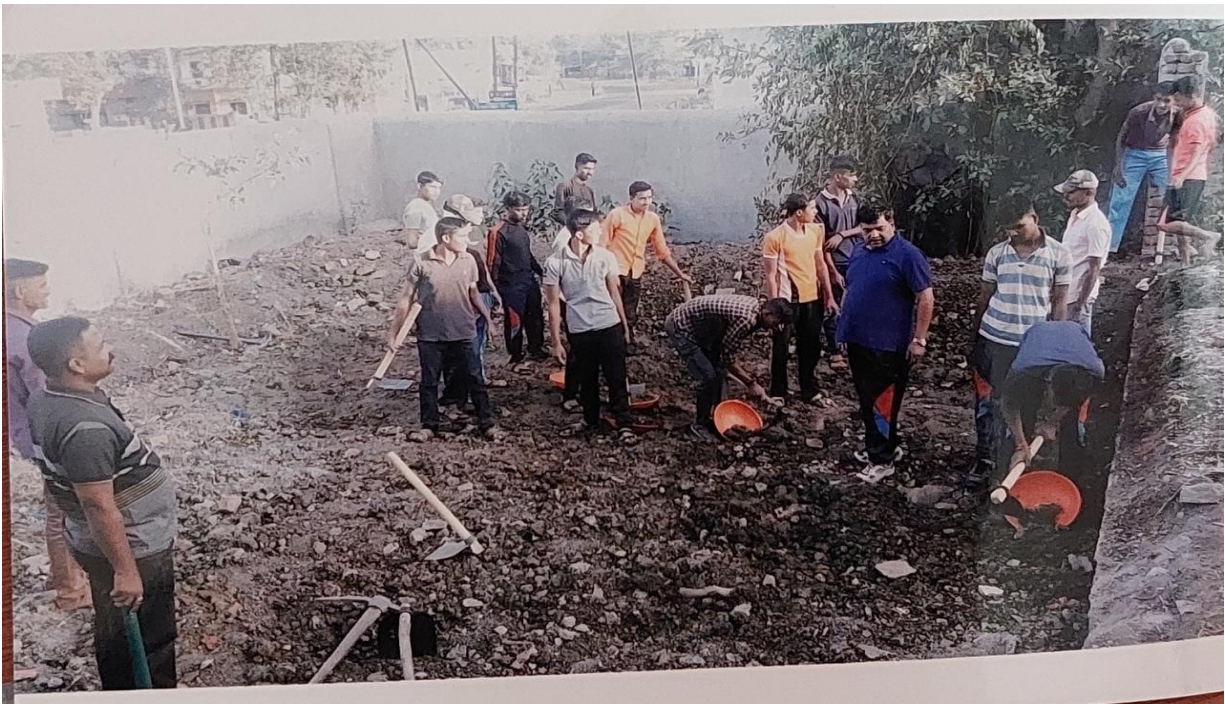
N.C.C. Cadets & Officers Excavating Mud from a Well at Hattikhana, Ambajogai