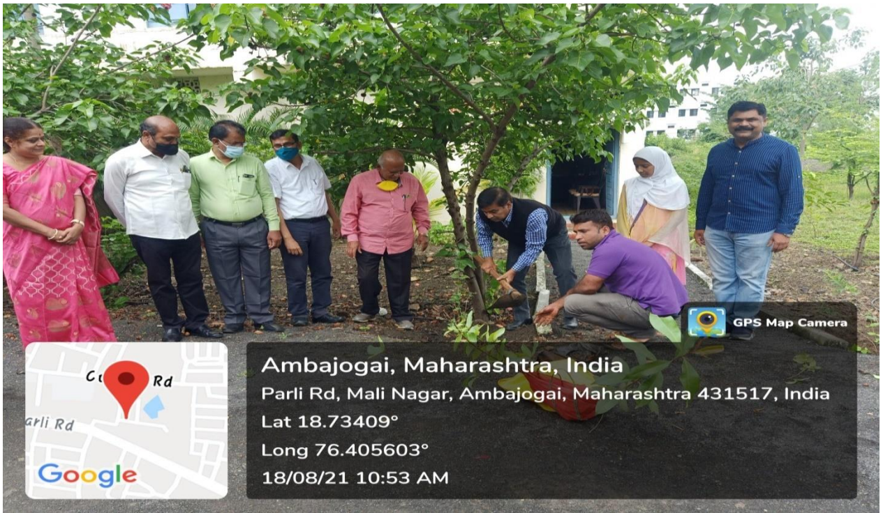
Tree Plantation by N.C.C. Officers and College Officials