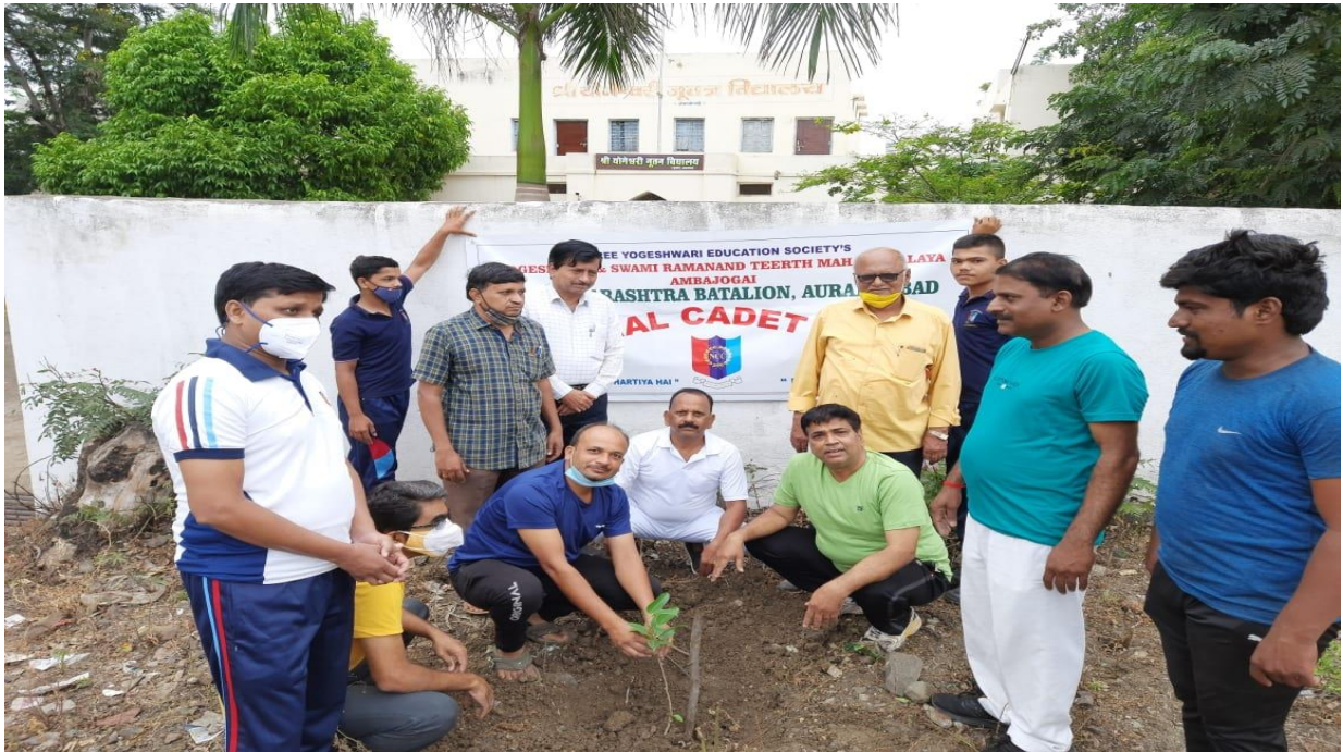
Tree Plantation by N.C.C. Officers and Cadets