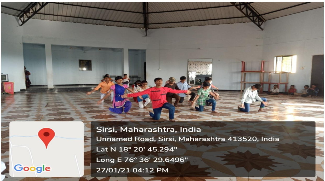
Sevalalya students performing a cultural act