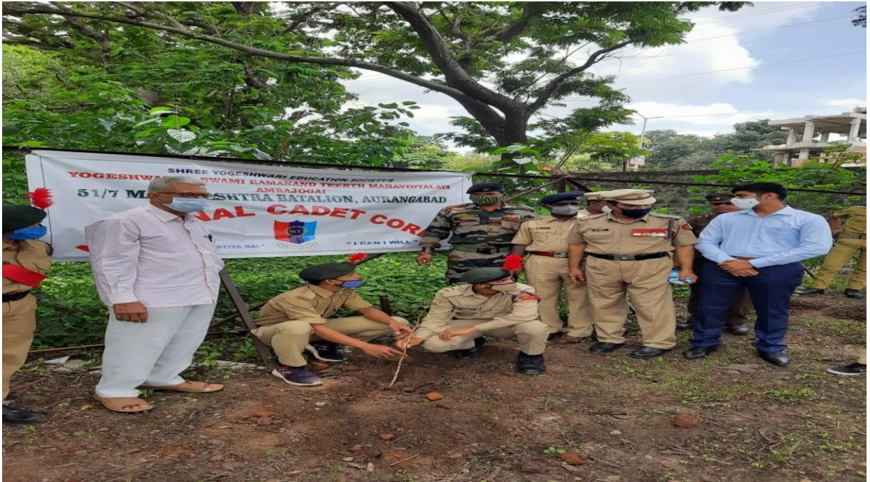
Tree Plantation by N.C.C. Officers and Cadets