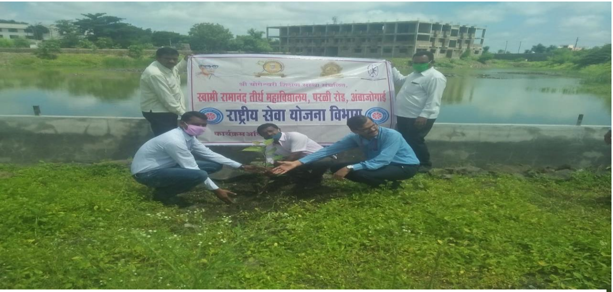
Tree Plantation by N.S.S. Volunteers