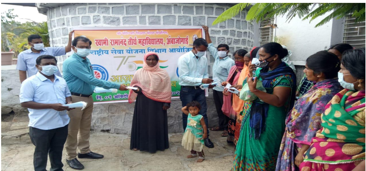
N.S.S. Volunteers and N.C.C. Cadets distributed the masks among the college students, local citizens, and patients in Government Hospital during the covid19