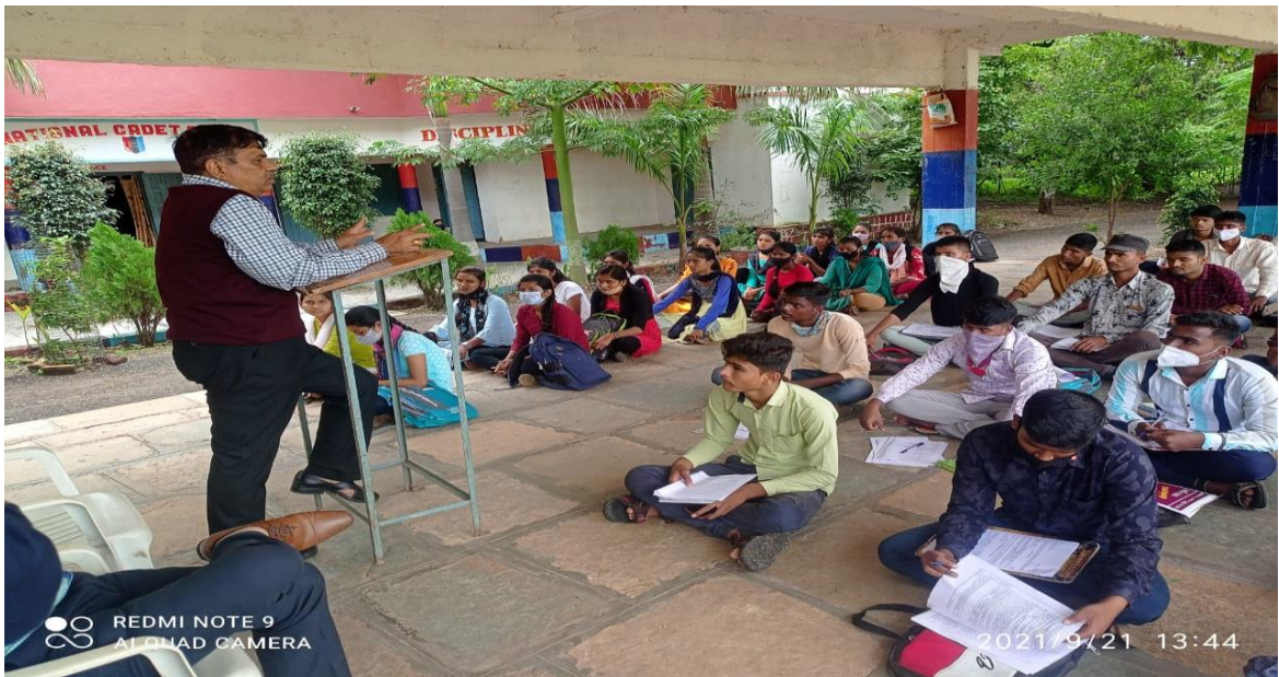
N.C.C. Officers having Conversation with Cadets about Diet and Hygiene

N.C.C Officers and Cadets organized the awareness campaign about the importance of diet and hygiene for good health.