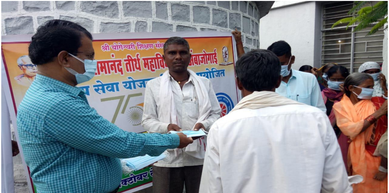
N.S.S. Volunteers and N.C.C. Cadets distributed the masks among the college students, local citizens, and patients in Government Hospital during the covid19

N.S.S. Volunteers and N.C.C. Cadets distributed the masks among the college students, local citizens, and patients in Government Hospital during the covid19 period and spread the awareness of about the importance of using masks and maintaining the hygiene to protect them from the infection of Covid19.