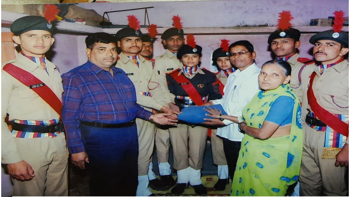
N.C.C. Cadets & Officers distributed cloths among need people

The Cloth Bank is run in the college premises by the N.C.C. Cadets. The awareness about cloth donation is spread among the people and the collected cloths are donated to the needy people.