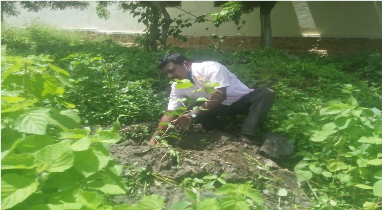
Vegetable Cultivation by N.S.S. Volunteers residing in the Hostel

The college has the open land where it is possible to cultivate vegetables for the students of the hostel. The students of the hostel and the rectors of the hostel cultivate vegetable for their daily use.