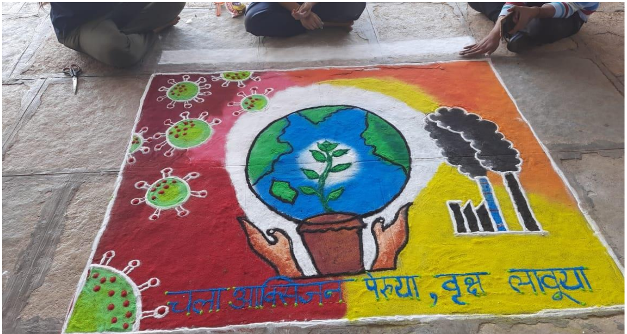
Rangoli Drawn by the Students for Tree Plantation awareness

Tree Plantation drives are organized by N.S.S. volunteers and N.C.C. cadets on the different occasion in the college and in the nearby area 16 July 2021, 18 August 2021 and on the occasion of birth anniversaries of national leaders in Ambajogai area and in the farms of farmers. The volunteers and cadets are planted Desi trees include Neem, Pimple, Banyan Tree, Tamraudus Indica etc. Some volunteers, cadets and teachers and non-teaching staff were assigned the task to water the plants. Volunteers planted 10,000 trees in a year in surrounding area of the college, Ambajogai and the surrounding villages.