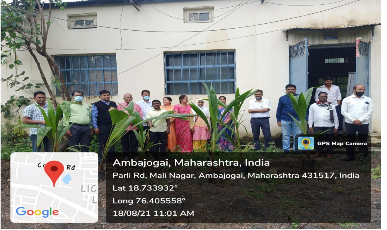
Tree Plantation by N.C.C. Officers and College & Management Officials