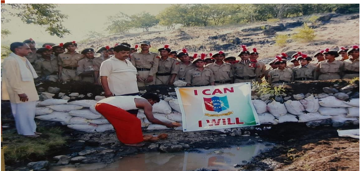
N.C.C. Cadets & Officers Developed Band