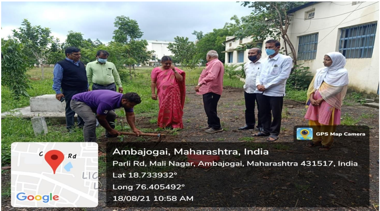
Tree Plantation by N.C.C. Officers and College Officials