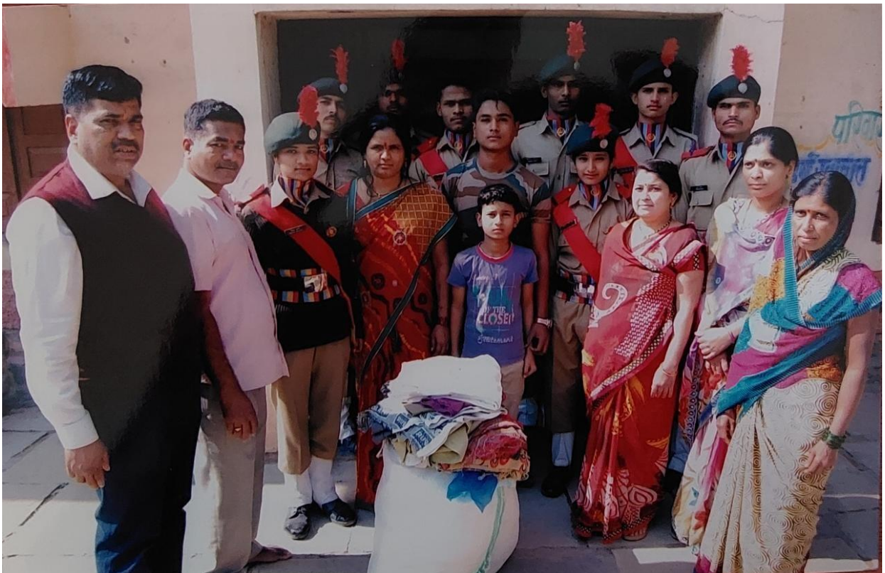
N.C.C. Cadets & Officers distributed cloths among need people