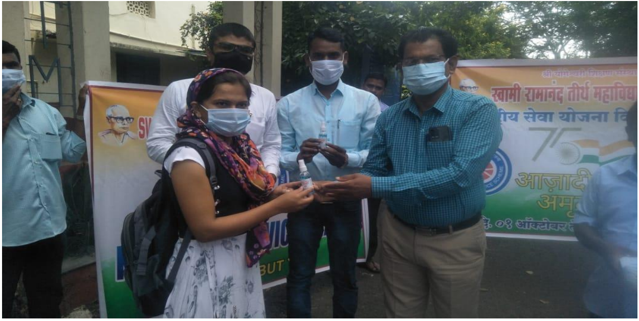
N.S.S. Volunteers and N.C.C. Cadets distributed the masks and sanitizer among the college students, local citizens, and patients in Government Hospital during the