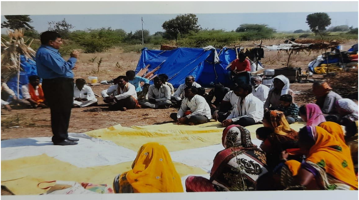
N.C.C. Cadets & Officers having an interaction with the Sugarcane workers