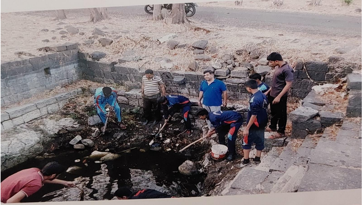
N.C.C. Cadets & Officers Excavating Mud from a Well at Dasopant, Ambajogai

The excavation campaign was organized by the N.C.C. Cadets. The Cadets visited the Historical wells and excavated the mud, garbage from the wells.