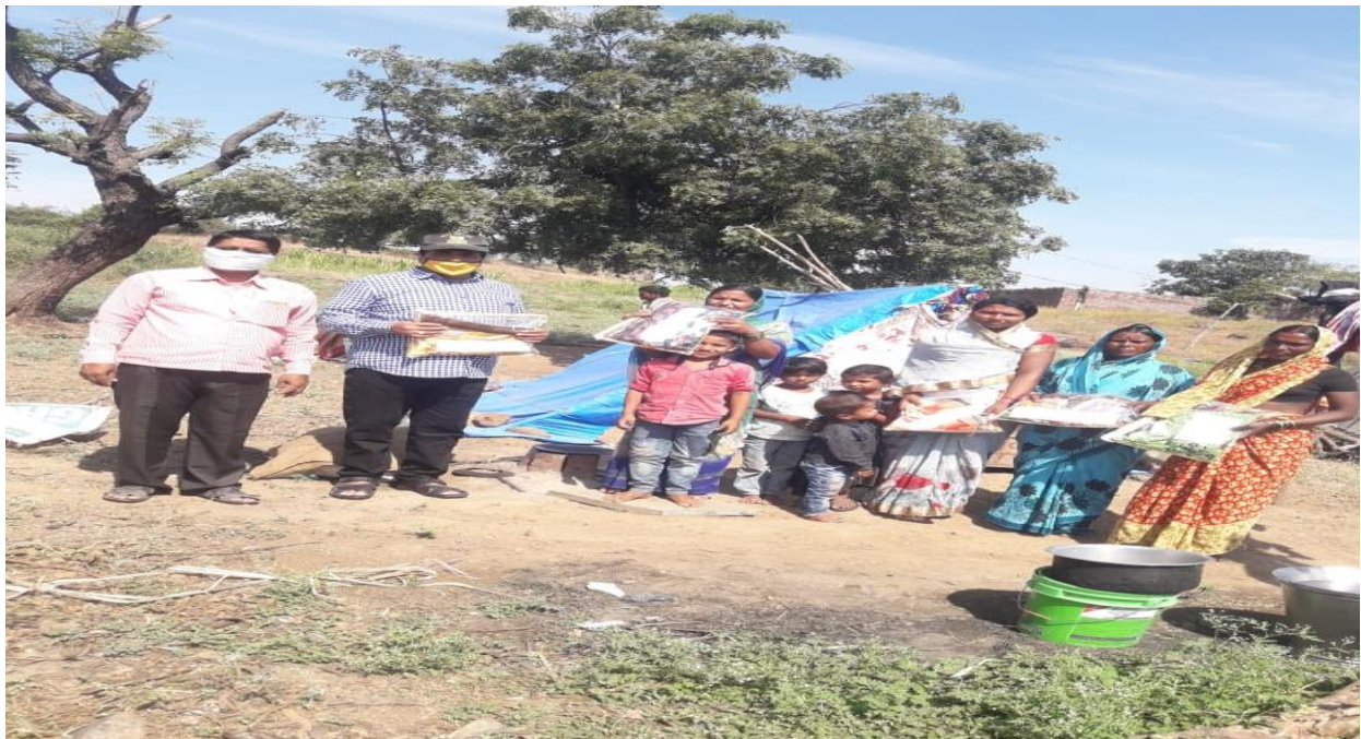
N.C.C. Cadets & Officers distributing Grocery and food to Sugarcane workers