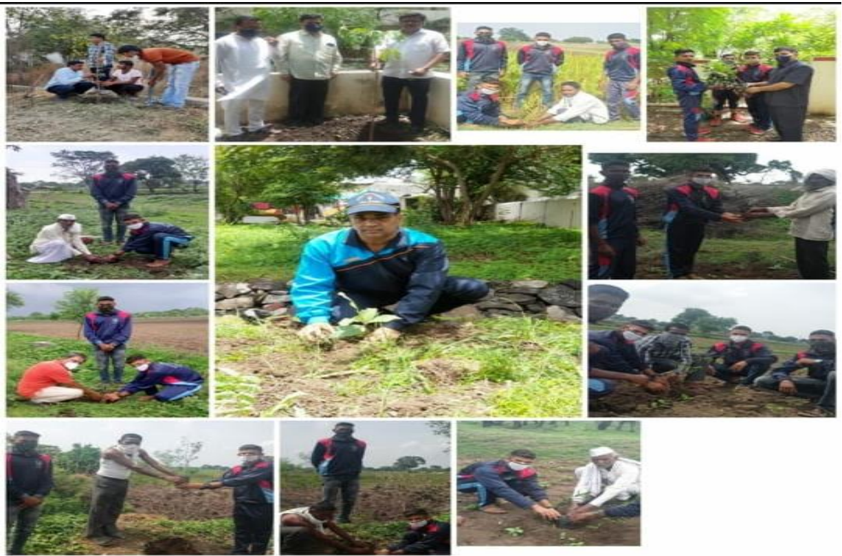
Tree Plantation by N.C.C. Officers and Cadets