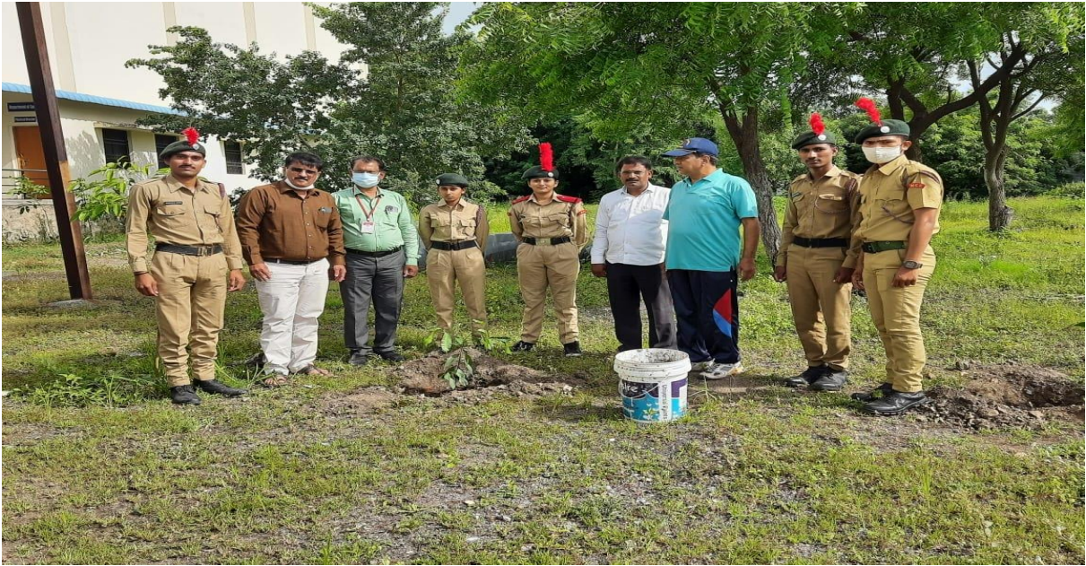
Tree Plantation by N.C.C. Officers and Cadets