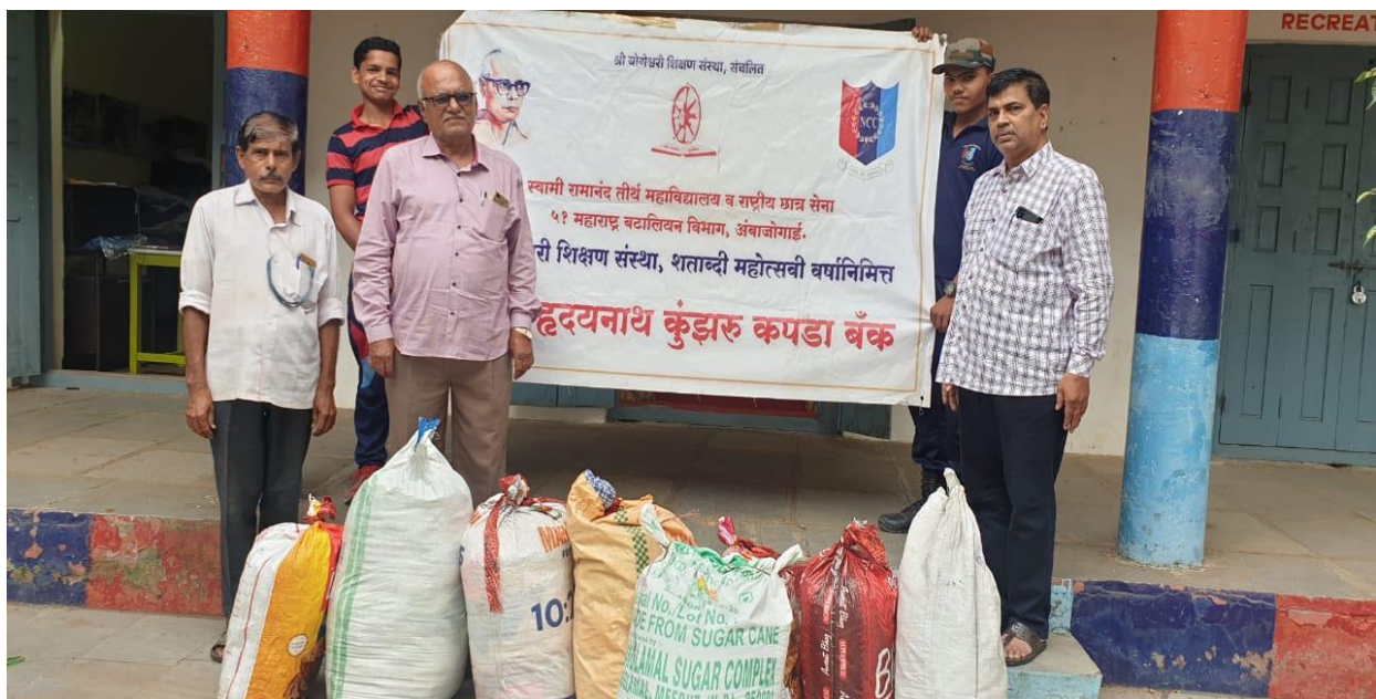
N.C.C. Cadets, Officers & Management distributing Grocery and food to Sugarcane workers