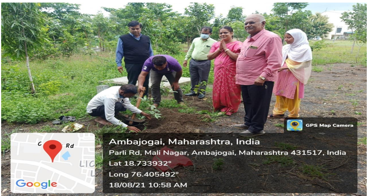
Tree Plantation by N.C.C. Officers and College Officials