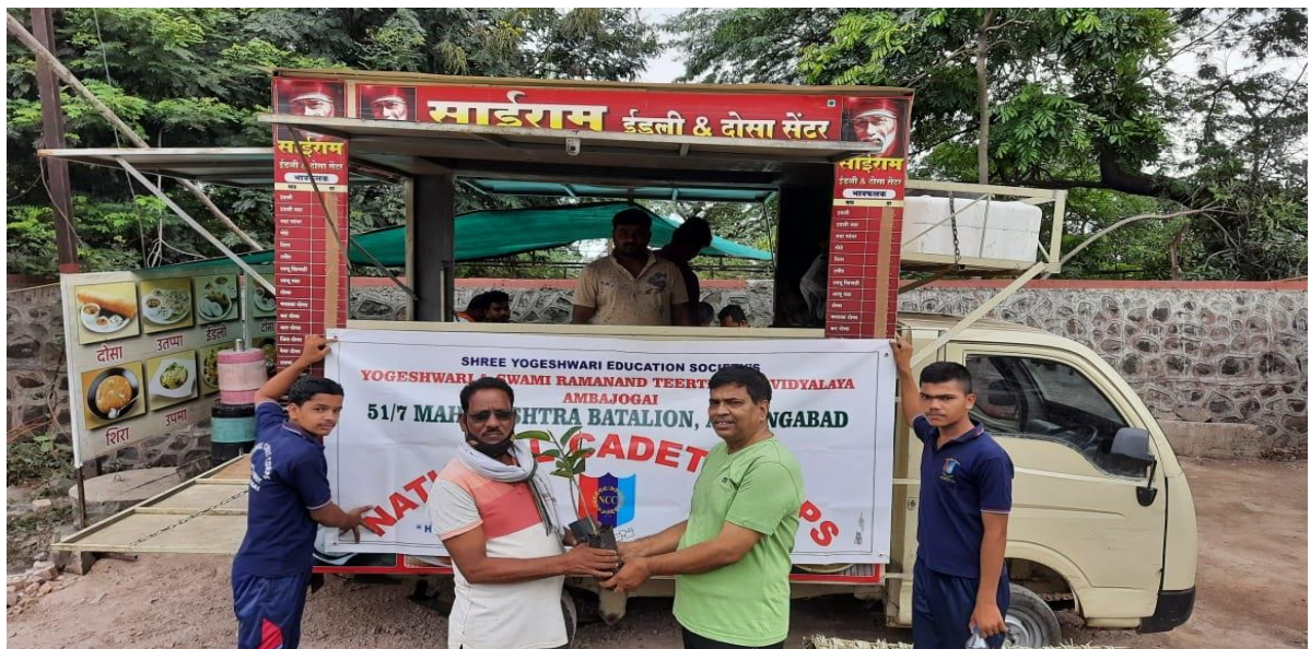
Sapling Distribution by N.C.C. Officers and Cadets