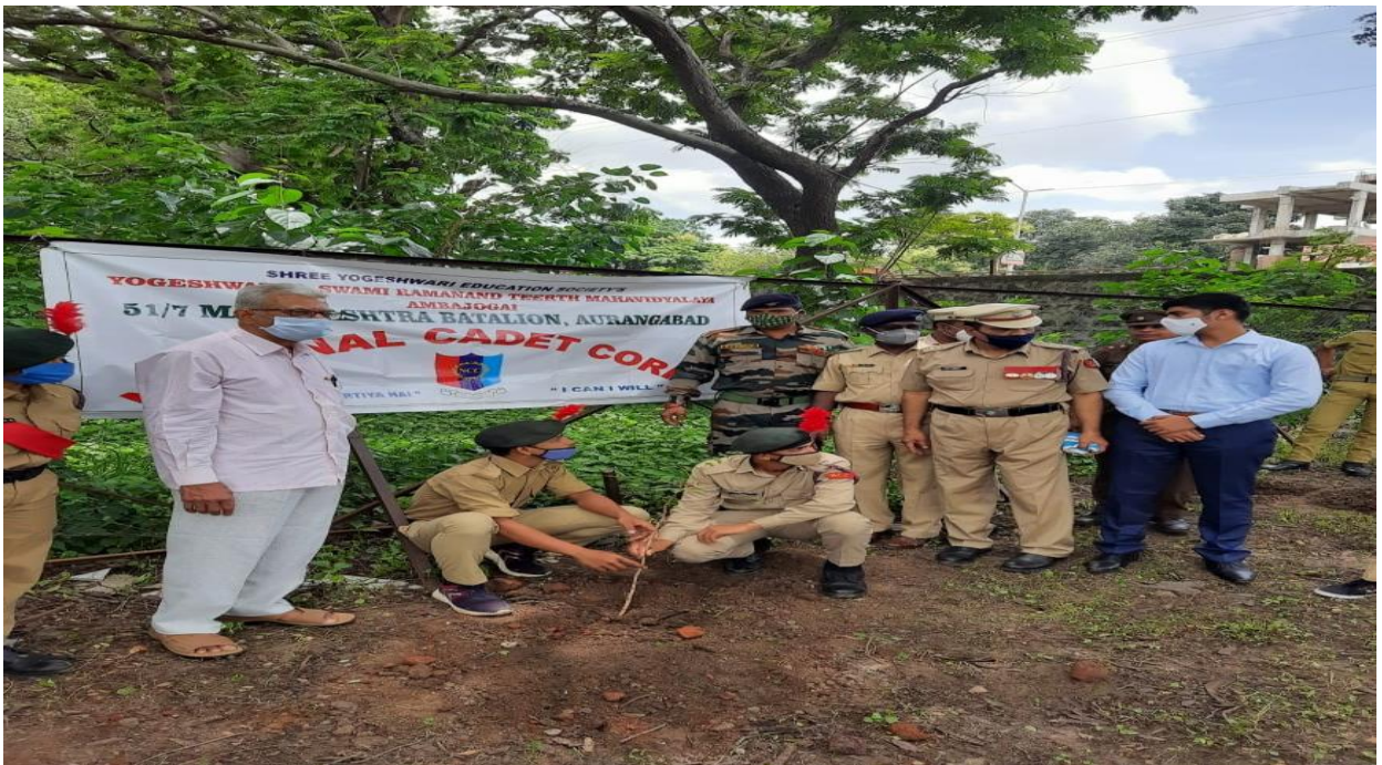
Tree Plantation by N.C.C. Officers and Cadets