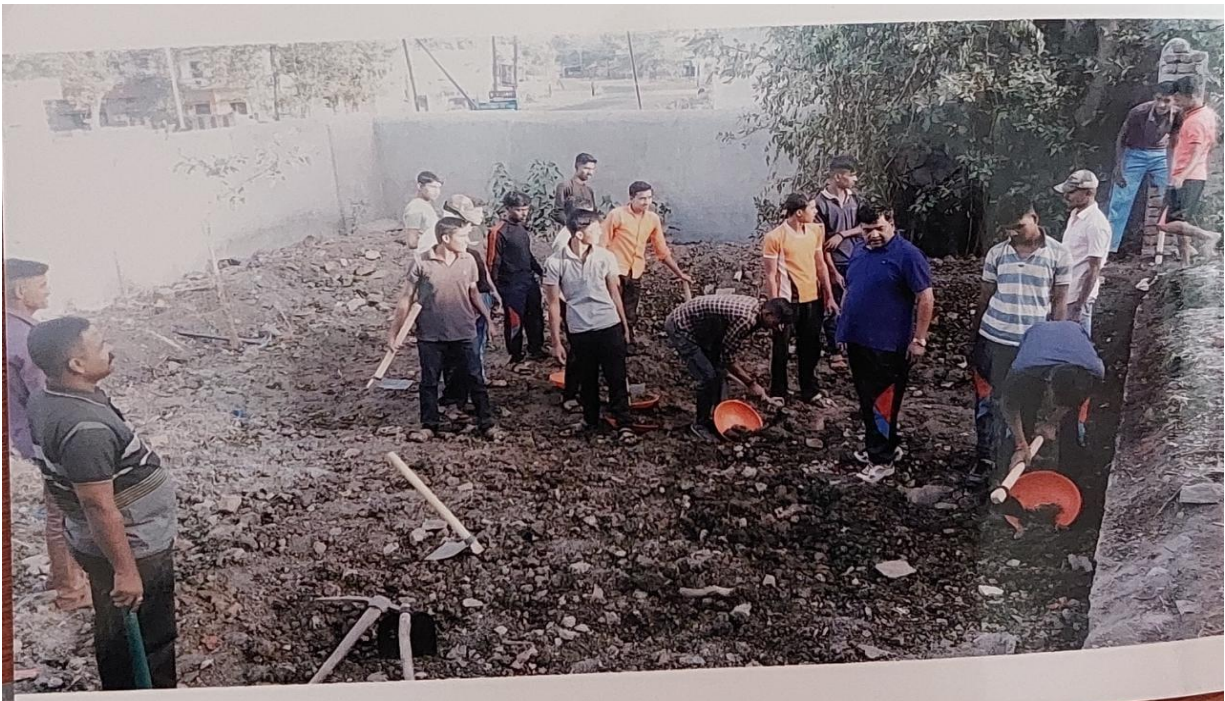
N.C.C. Cadets & Officers Excavating Mud from a Well at Hattikhana, Ambajogai