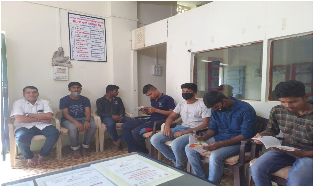
Participants of a Competition during Gandhi Saptah