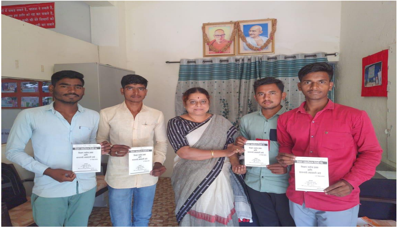
Books Presented to the winners of various competitions in Gandhi Saptah