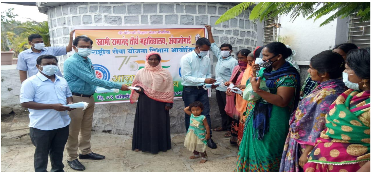
N.S.S. Volunteers and N.C.C. Cadets distributed the masks among the college students, local citizens, and patients in Government Hospital during the covid19