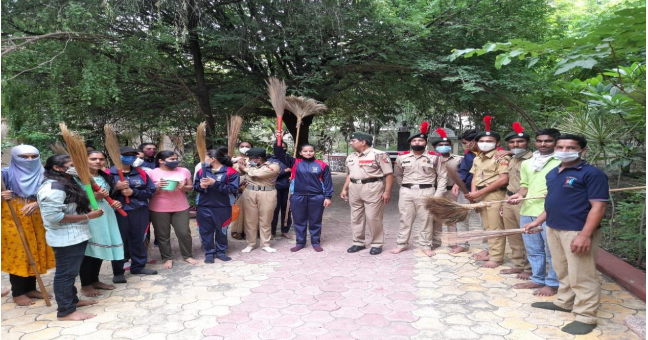
N.C.C. Cadets & N.S.S. Volunteers participated in Cleaning Campaign

N.S.S. Volunteers and N.C.C. cadets of the college organized the cleaning campaigns in the college premises, nearby localities and religious places of Ambajogai.