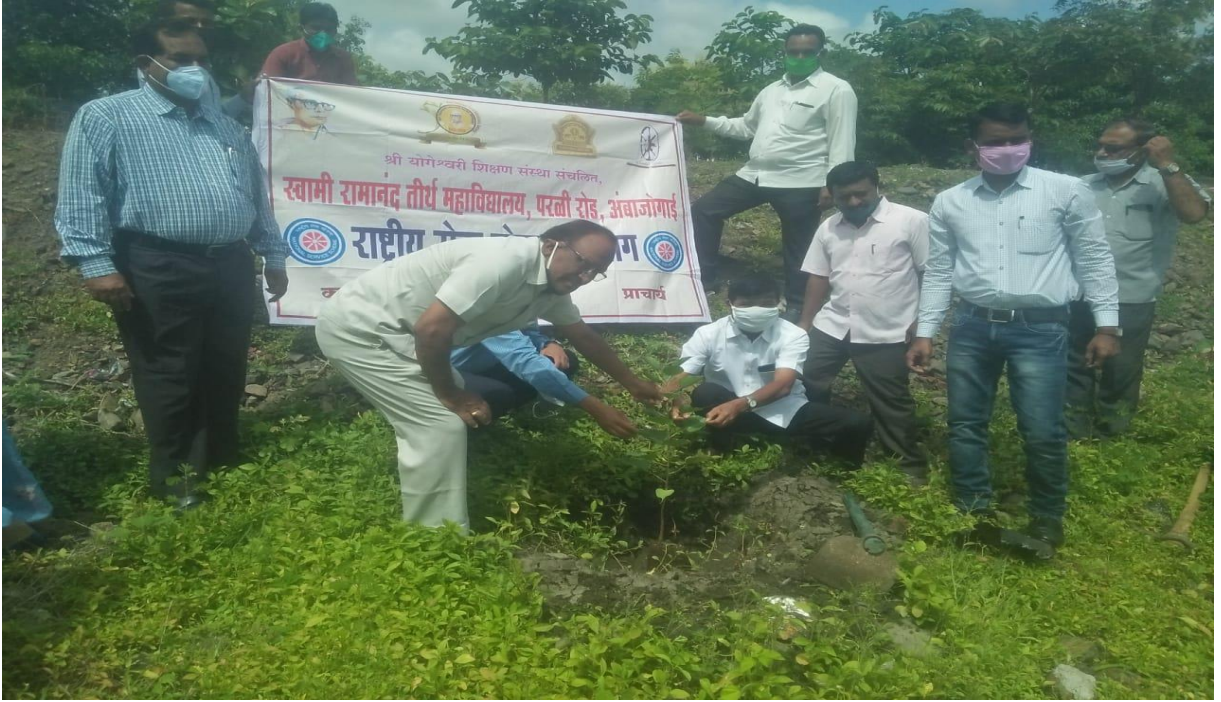
Tree Plantation by N.S.S. Volunteers