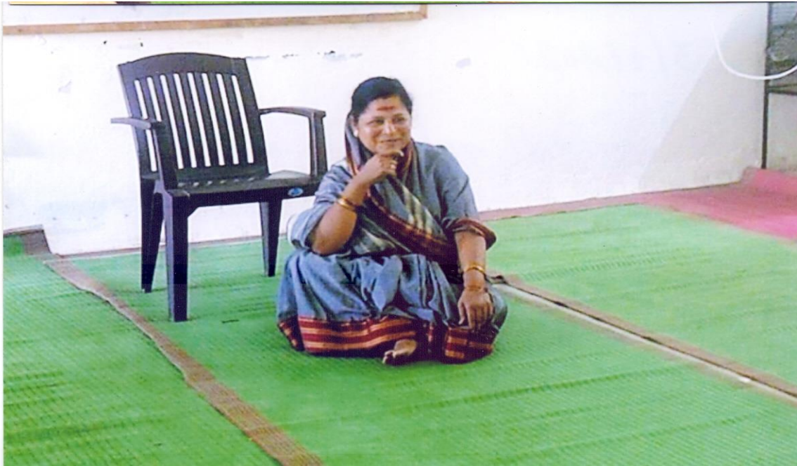
"Savitri Utsav" was held on the occasion of Savitribai Phule's birthday