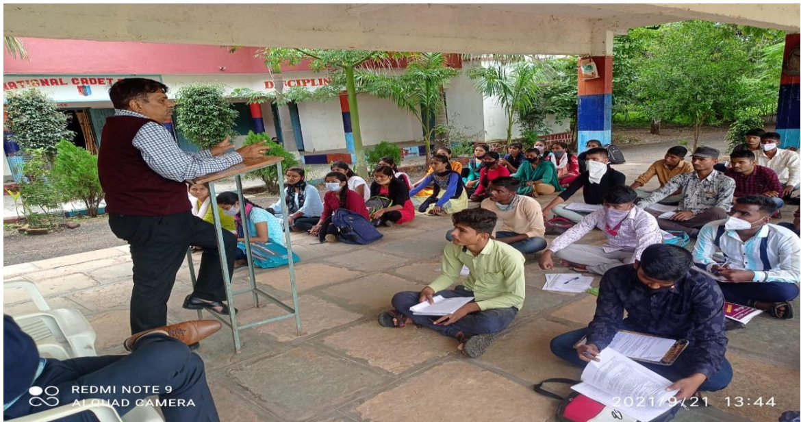
N.C.C. Officers having Conversation with Cadets about Diet and Hygiene

N.C.C Officers and Cadets organized the awareness campaign about the importance of diet and hygiene for good health.