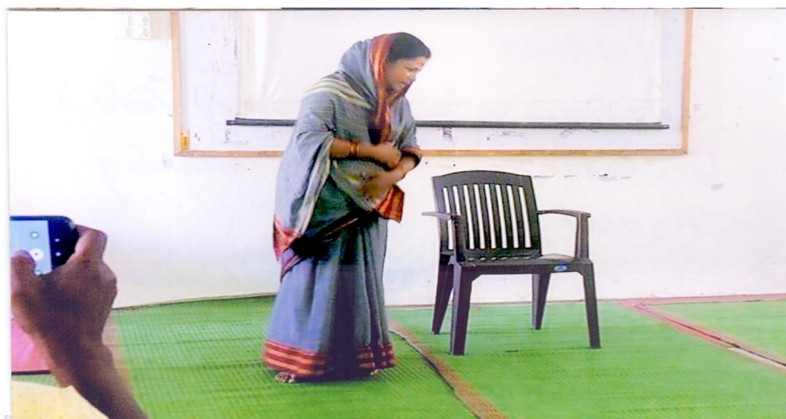
"Savitri Utsav" was held on the occasion of Savitribai Phule's birthday