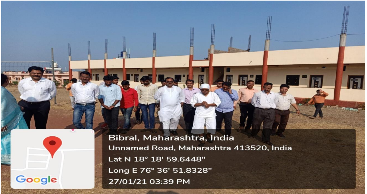
The College Staff, Students and Management Visited 'Sevalaya' Dist. Latur