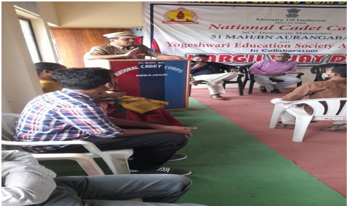
Kargil Vijay Divas and Anti-Terrorism Day was Celebrated