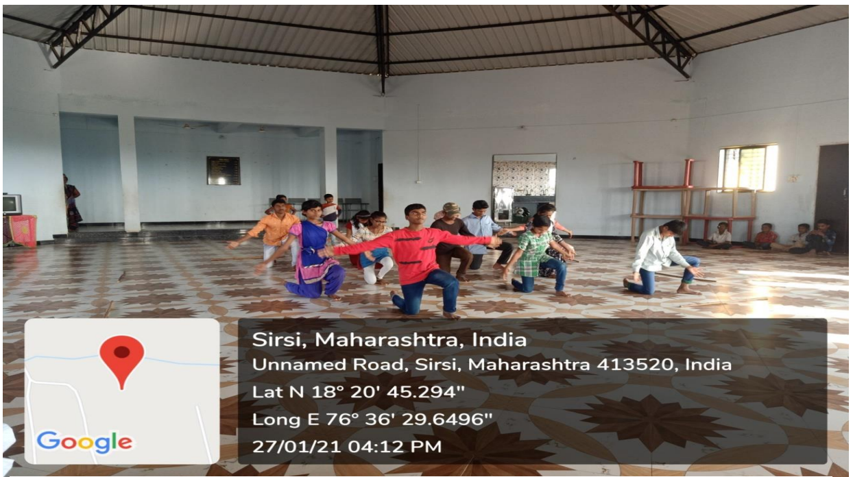
Sevalalya students performing a cultural act